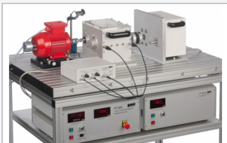
The illustration shows PT 500.05 together with PT 500, PT 500.01, PT 500.15 and PT 500.04.